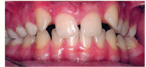
(A) Before treatment