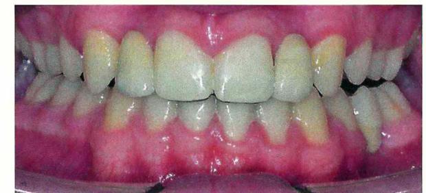
(D) Patient with bridges in place