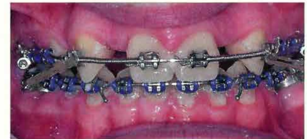
(B) Wearing fixed braces